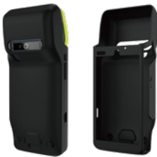
Silicone Cover Customized colors