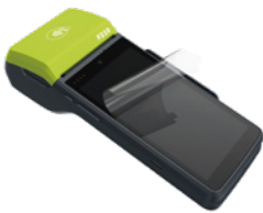
Screen Protector Hydrogel film