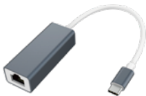
Type C to RJ 45 Adapter 100 Mbps Ethernet LAN