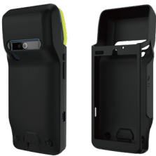
Silicone Cover Customized colors