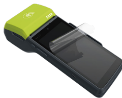
Screen Protector Hydrogel film