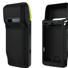
Silicone Cover Customized colors