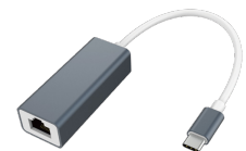
Type C to RJ 45 Adapter 100 Mbps Ethernet LAN