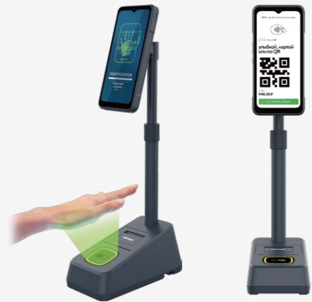
Self-service kiosk B