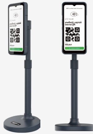
Self-service kiosk A